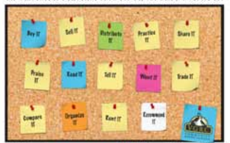
Visit us at www.vgrcca.us and Click, the wall of something